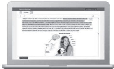
Laptop: McGraw-Hill; Woman/dog: George Doyle/Getty Images